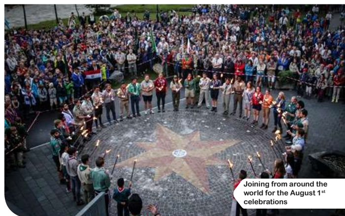
Joining from around the world for the August 1 st celebrations