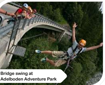
Bridge swing at Adelboden Adventure Park