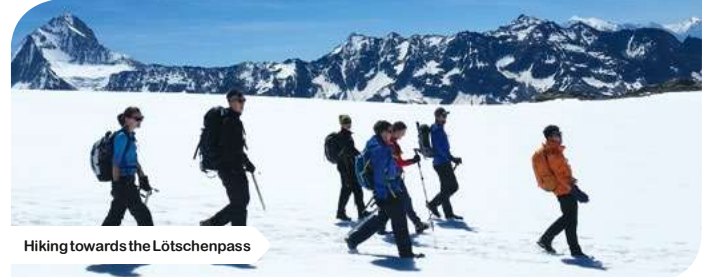
Hiking towards the Lötschenpass

Other mountain huts can also be found in the area. These need to be booked directly with the huts. These include Balmhorn Hut, Gspaltenhorn Hut, Lämmeren Hut and Muthorn Hut. Please contact the Centre for advice before booking, since these huts are located in a remote alpine environment.