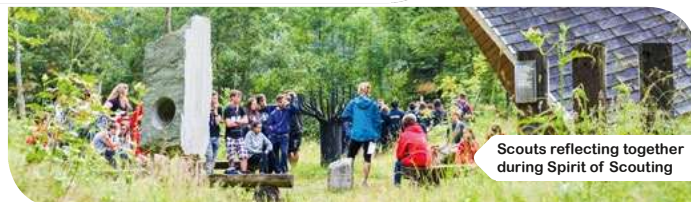
Scouts reflecting together during Spirit of Scouting