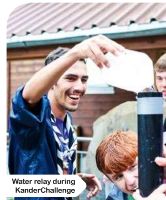
Water relay during KanderChallenge

Learn about the impact of the Scout Movement on a global level, and discover similarities and differences you have with Scouts from other countries. This activity will make you reflect and share your thoughts with other Scouts, empowering you to create a better world!