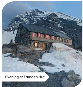
Evening at Fründen Hut