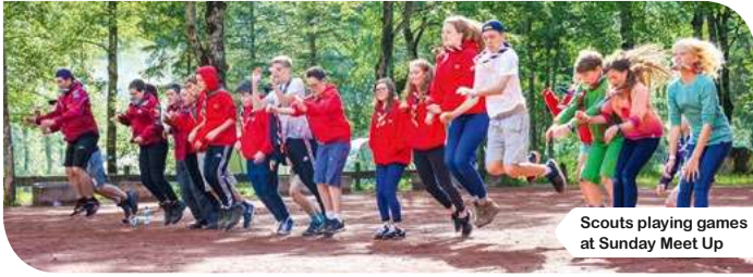
Scouts playing games at Sunday Meet Up