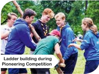
Ladder building during Pioneering Competition

In your team you will take part in a number of fun races with Scouts from all over the world. Don't miss this opportunity to see the world from a different angle.